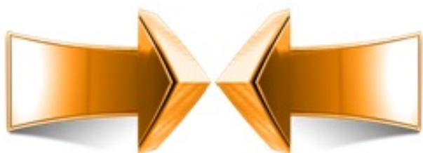
The proposed Challenge Coaching Program logo

In keeping with a national modern image there is a proposed new logo.