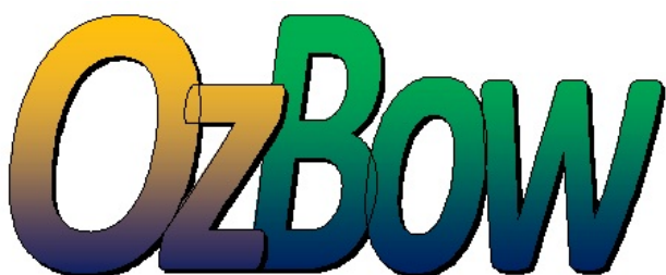
The proposed OzBow logo

In a national marketplace it is important that we project a professional and consistent image. In line with what other sports have done we propose taking the term OzBow and making it synonymous with grassroots archery.